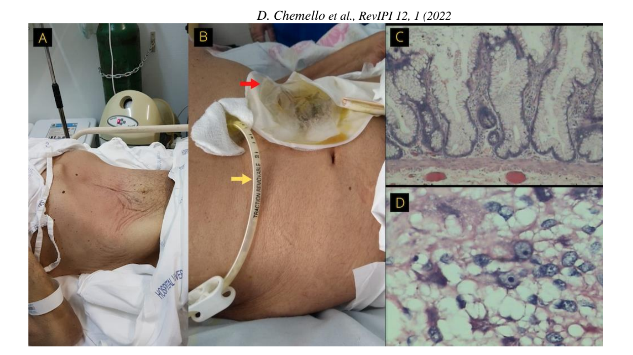
Figure 3. Immediate results after colonoscopic decompression, showing temporary improvement of the colonic distention (3A). Result after surgical intervention (3B). The colostomy bag is shown (3B, red arrow), as well as the enteral tube (3B, yellow arrow). Histological analysis of the colon revealed colonic mucosa with only mild distortion of glandular architecture (3C) and normal myenteric plexus (3D) (Hematoxylin and eosin stain).

After some days, the patient was able to restart enteral nutrition. He was discharged to the home-care unit. The 12-month follow-up showed normal status, without further abdominal distention.